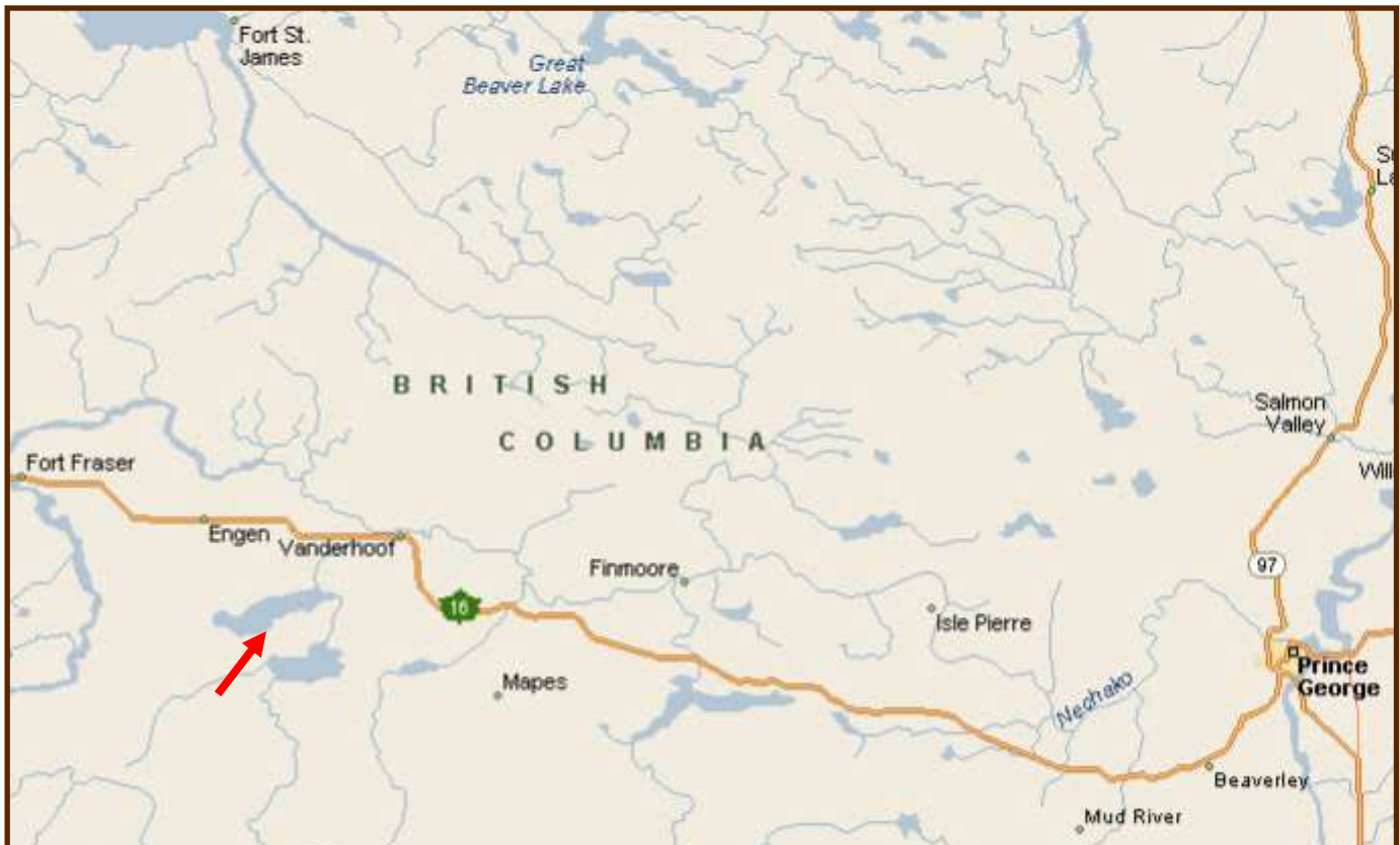
Regional Map —Nulki Lake Region

The Nechako river, which joins the Fraser river at Prince George, runs along the north edge of Vanderhoof. There are a number of very nice residences along the river whose owners have both boats and floatplanes. From this river, you can go on waterways for over 200 kilometers, up rivers and lakes. The people of Vanderhoof are low keyed, easygoing people who are mostly hobby farmers with horses and enjoy the outdoors fishing and hunting.